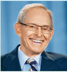
Sri Harold Klemp The Mahanta, the Living ECK Master

Each seminar builds toward the next one. They are geared toward the needs of the individuals who attend, and the needs are always changing. Each stage leads to a greater and greater circle, even as individually we move from one circle of initiation to a greater one.